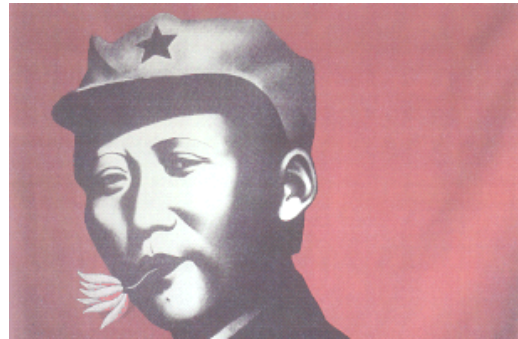
Li Shan, Rouge – Flower 1995. Silkscreen and oil on canvas. 4 ft. 3 in. x 6 ft. © Sigg Collection.

The Socialist Realist paintings that open the exhibition were created in the 1970s, during the Cultural Revolution. Provided as historical background, these are