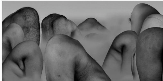
Liu Wei, It Looks Like a Landscape 2004. Black & white digital photograph. 10 ft. x 20 ft.

Other works make use of traditional Chinese art forms, if only to subvert them. At first glance, Liu Wei's hauntingly beautiful It Looks Like a Landscape appears to be a classical Chinese landscape of hills and mist, while in actuality, it is a composite of photographic close-ups of knees, backs, arms, and other body parts.